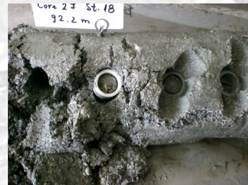
Optically Stimulated Luminescence (OSL) dating samples being taken.